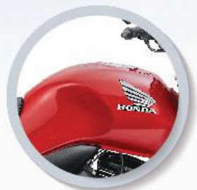
Imperial Red Metallic