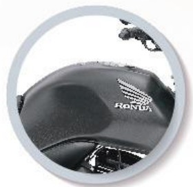
Matt. Axis Grey Metallic