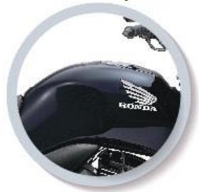
Pearl Siren Blue